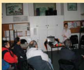
倫敦華心社在利茲華人中心演講 London Wah Sum Association talk at the LCCA centre