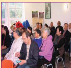
Macmillan Cancer Care 在利茲華人中心演講 MacMillan Cancer Care talk at the LCCA centre