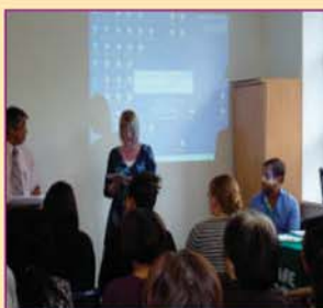
利茲華人協會與鈺鳴軒曲藝社為長者義唱賀中秋 LCCA & Yuk Ming Hin free singing to the elderly for the Mid Autumn Festival